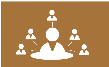
Networking & learning techniques

Creating platform for the corrugated packaging industry