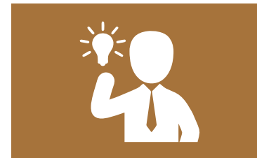
Generate business leads