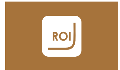
Maximise your ROI