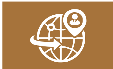
Develop international presence